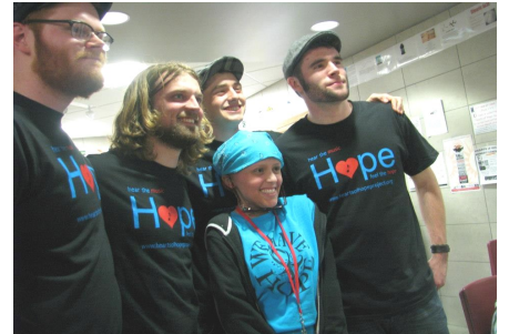
Hope, along with the Birdseed Bandits at last year's Hearts of Hope Concert!